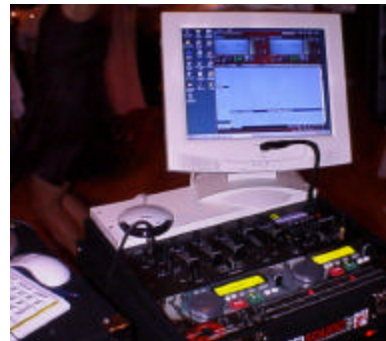
State of the art music programming systems

We use only the highest quality professional audio and lighting equipment