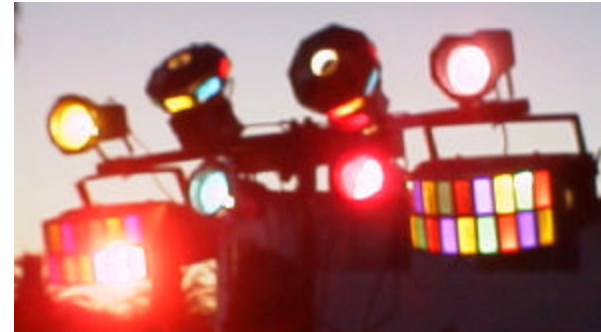
Lighting & Special Effects

We use only the highest quality professional audio and lighting equipment